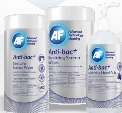
Anti-bac+™ Sanitizing Surface Wipes

Door handles / Light switches / Car steering wheel / Gym equipment